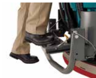
RECOVERY ACCESS STEP

Lower maintenance and repair costs with a heavy-duty front bumper and rear squeegee protection kit that prevents damage to the machine.