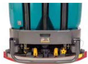
SQUEEGEE PROTECTION KIT

Simplify training and keep the operator's attention facing forward with the Touch-n-Go™ Control module. The large green 1-Step™ Start Button activates the scrubbing systems and engages the most recent operating setting.